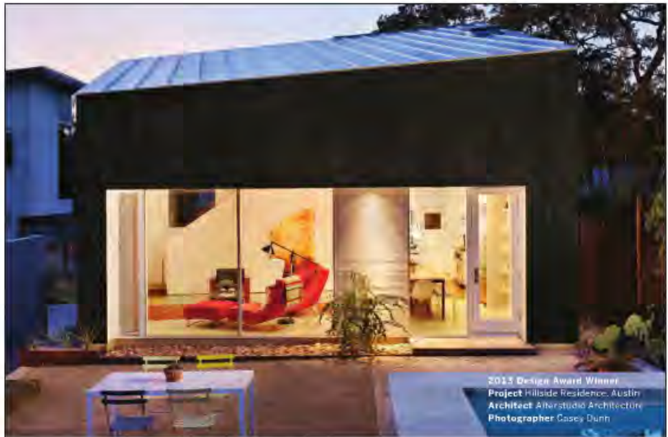
2013 Design Award Winner Project: Hillside Residence, Austin Architect: Alterstudio Architecture

Resources CONCRETE PAVEMENT: Campbell Concrete & Materials; FENCES, GATES, AND HARDWARE: Schlage, Ives, LCN, Von Duprin, Glynn Johnson; CONCRETE MATERIALS: Campbell Concrete & Materials; MASONRY UNITS: Holcim; MASONRY VENEER ASSEMBLIES: Headwaters; LAMINATES: Abet Laminati; WATERPROOFING AND DAMPROOFING: Henry Company; BUILDING INSULATION: Owens Corning; SIDING/FASCIA AND SOFFIT PANELS: James Hardie; METAL ROOFING: Berridge Manufacturing; METAL DOORS, FRAMES, AND WINDOWS: Oldcastle; PREASSEMBLED METAL DOOR AND FRAME UNITS: Arm-R-Lite; GLASS: PFG Indus- tries; GYPSON FABRICATIONS: USG; TILE: Daltile; LAMINATE FLOOR- ING: Johnsarite; PAINTS: Farrow & Ball; SIGNAGE AND GRAPHICS: Ostrom Glass & Metal; AWNINGS: Avadek ■