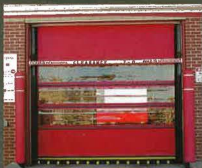
VINYL ROLL UP DOORS